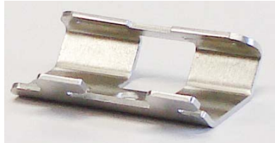
LD-IT LED Sign End Mounting Installation Tool.

The display mode and colour options are set-up using a separate remote control, the LD-RPC.