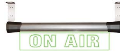
The LD-KC1 mounting kit used to attached the sign to the ceiling.

The LD-KC1 mounting kit can be used to attach a 40cm or 20cm flush mounting sign to the ceiling or a desktop.