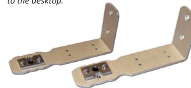
The LD-KC1 mounting kit.