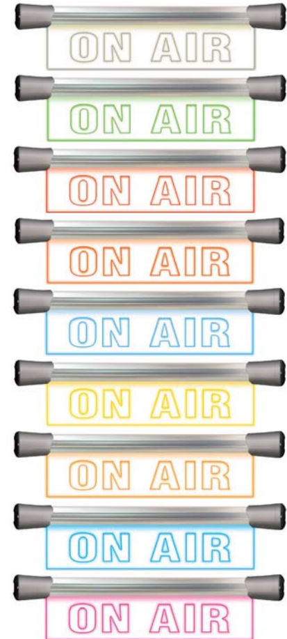
9 different colours of the SignalLED Sign.