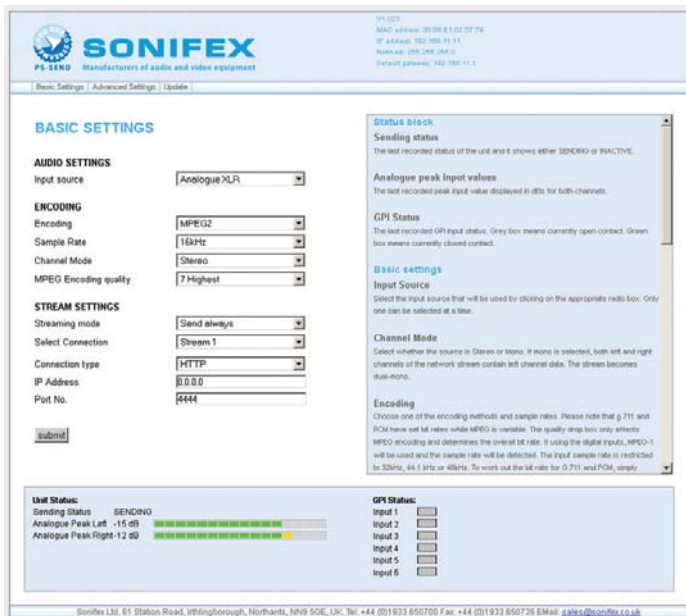
Fig 5-1: The PS-SEND Webpage