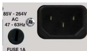
Fig 2-14: PS-SEND IEC Power Plug & Fuse.

The fuse socket is a where the anti-surge fuse 1A 20 x 5mm fuse is inserted. Please unplug the unit whenever opening this cover.