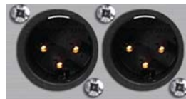
Fig 3-8: PS-PLAY Analogue Outputs