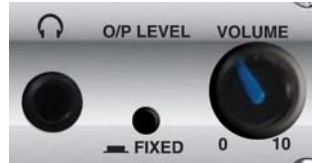
Fig 3-6: PS-PLAY Headphone Socket, Volume Control & Output Level Control.

The headphone output has its own volume control and has a maximum output level of +12dBu.