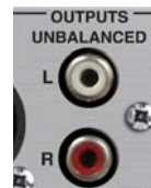
Fig 3-9: PS-PLAY RCA Phono Analogue Outputs.