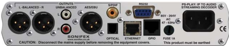
Fig 3-7: PS-PLAY Rear Panel.

All audio connections are outputs on this unit.