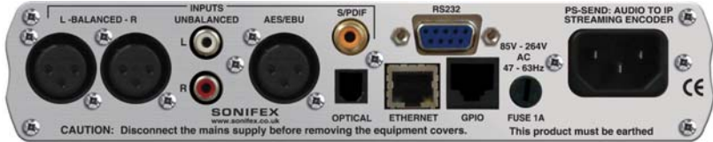
Fig 2-5: PS-SEND Rear Panel.

All the audio connectors together with the ethernet, serial and GPI/O connectors are found on the rear panel of the unit. All the audio connections are inputs on this unit.