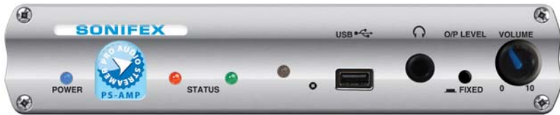
Fig 4-1: PS-AMP Front Panel.

The PS-AMP is a freestanding unit which converts an IP audio stream directly to speaker outputs. It is also available in a 1U rack-mount as the PS-AMPS. The PS-AMP has the same feature-set as the PS-PLAY except that there are no individual audio outputs other than the speaker terminals. The PS-AMP uses an integrated 2 x 15W D-class amplifier to deliver audio directly to a pair of connected speakers.