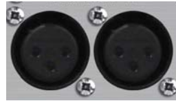
Fig 2-6: PS-SEND XLR Analogue Inputs.