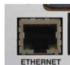
Fig 4-9: PS-AMP ETHERNET Port.