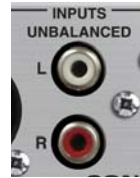
Fig 2-7: PS-SEND RCA Phono Analogue Inputs.