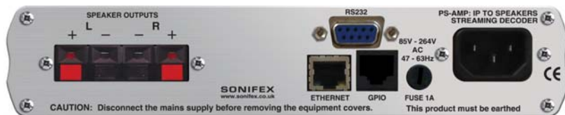
Fig 4-7: PS-AMP Rear Panel.