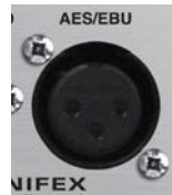
Fig 2-8 PS-SEND AES/EBU Input.

The signals on this connector should meet the IEC 60968 specification