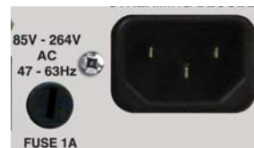
Fig 4-11: PS-AMP IEC Power Plug & Fuse.