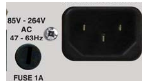
Fig 3-16: PS-PLAY IEC Power Plug & Fuse.

The fuse socket is where the anti-surge fuse 1A 20 x 5mm fuse is inserted. Please unplug the unit whenever opening this cover.